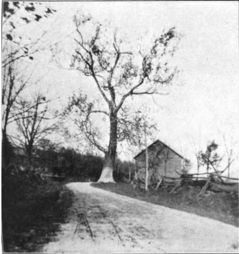
Washington Sycamore, c. 1910.